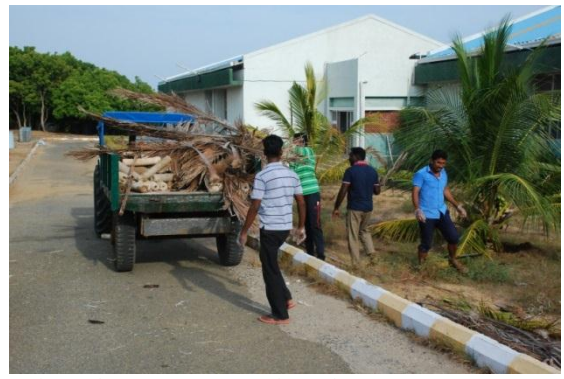
Staff of Mandapam Regional Centre cleaning the areas near hatchery