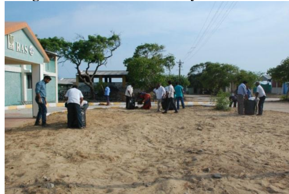
Staff of Mandapam Regional Centre cleaning the areas near RAS facility