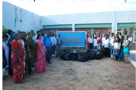
Staff who were actively involved in 'Swachh Bharat Abhiyan' activities