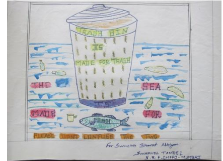
Third Prize (Staff)