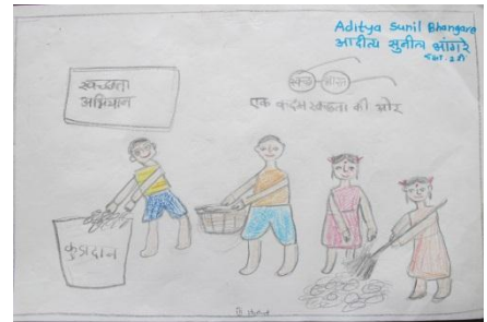
Third Prize (Student)