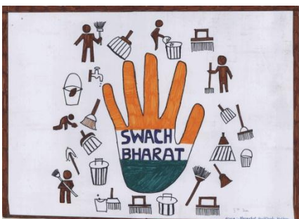
First Prize (Women)