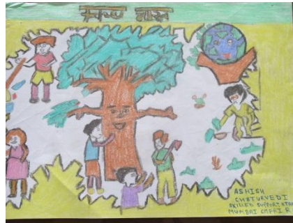
Second Prize (Staff)