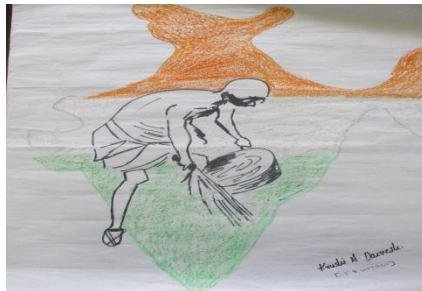
Second Prize (Student)