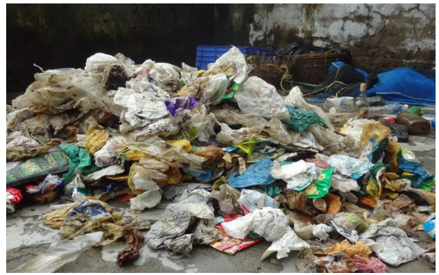
Litter collected from stake nets