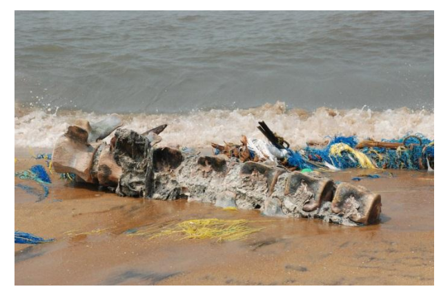
Whale bone in the ghost net