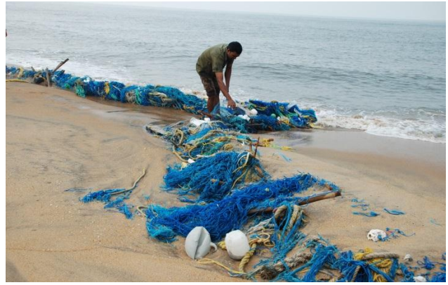
Ghost net with whale bone and other litter -Vypin beach