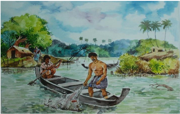
Will this be the state of our coastal waters and fishers