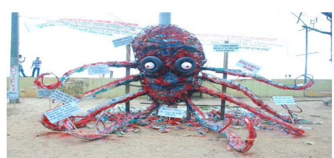
installation art by CMFRI at Cheari beach