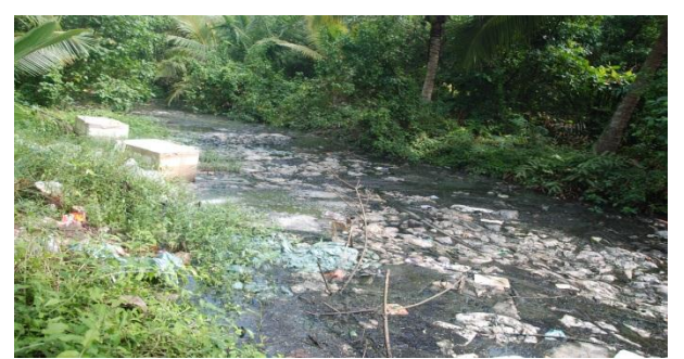
Canals clogged with litter