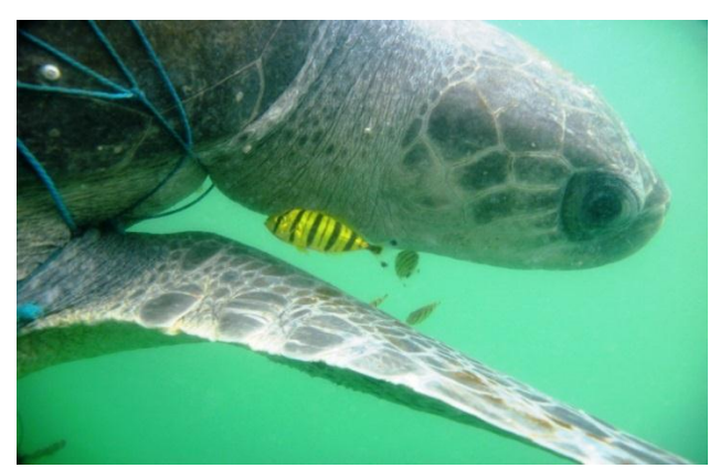
(Outreach Section) Turtle entangled in ghost net in Palk Bay